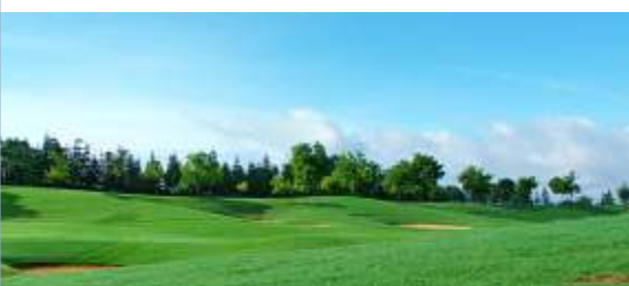
GOLF COURSE & CONVENTION CENTRE