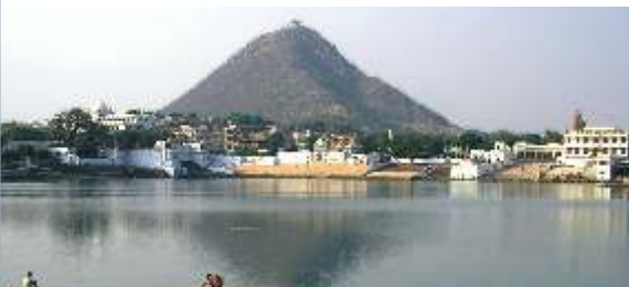
RESTORATION OF LAKES