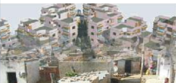
SLUM AREA DEVELOPMENT