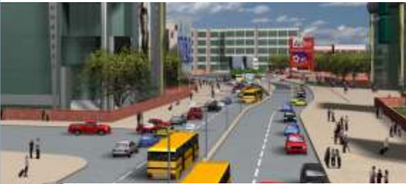
BUS RAPID TRANSIT SYSTEM, JAIPUR