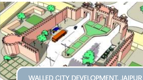
WALLED CITY DEVELOPMENT, JAIPUR