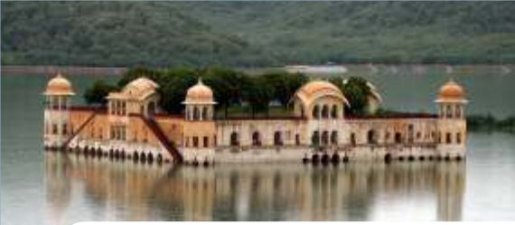
JAL MAHAL PROJECT, JAIPUR